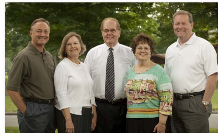
PRESIDENT'S MANAGEMENT GROUP

The New Year is upon us. With it comes opportunity. We have helped many, but the needs have not diminished. God's storehouse of hope, however, is still in plentiful supply. Join with us! Together, let us share this abundant hope and fill the hearts of all those who will look to Baptist Children's Homes in 2012.