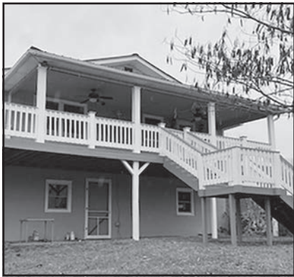
Laura's Homes: BCH will be overseeing two existing cottage homes for children in Shelby. The leadership of these independently

River Hill Refuge: Construction of three new family foster homes in Shelby, NC is well under-way. Couples aspiring to be foster parents will be able to do so by living at these new homes which will allow them to care for more children, including sibling groups, than their personal homes will allow.