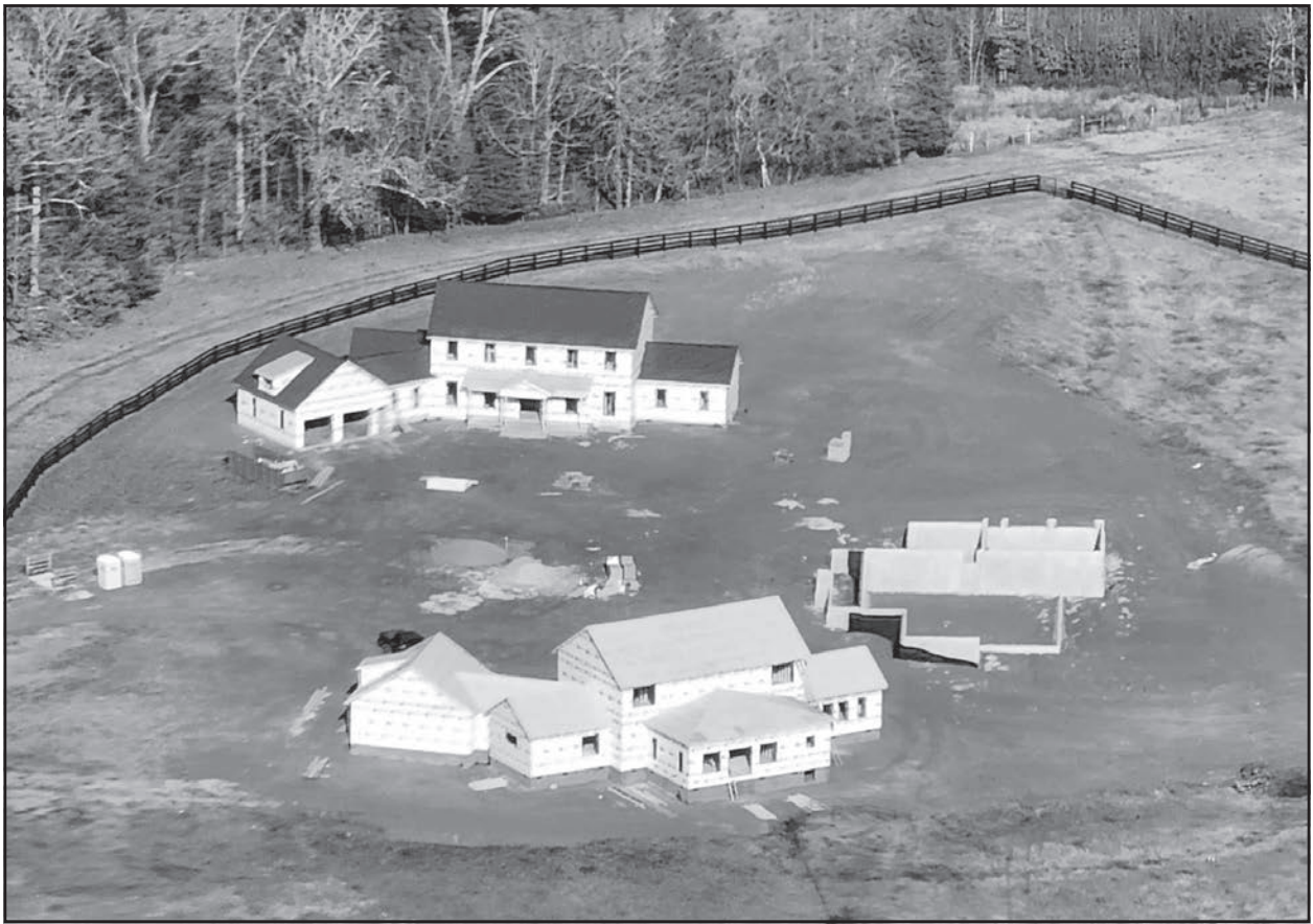
Above clockwise, River Hill Refuge, three family foster homes made possible by gifts from the Westmoreland family, is being constructed in Shelby. Emmanuel Home in Thomasville is being renovated for birth mothers who have chosen adoption for their babies. Laura's Homes in Shelby provides cottage care for children in the NC foster care system. Turner Cottage in Hayesville will be a family foster home for foster parents who need additional space to accept children. The Independent Living Home, sharing space with Turner Cottage and BCH's existing Truett Home, will help youth aging out of foster care. Watch for more information coming soon.

Emmanuel Home: Renovations are almost complete at Emmanuel Home in Thomasville. A dream project of BCH's Christian Adoption Services, the location on the outskirts of Mills Home in Thomasville will provide a home and support to women who chose adoption for their babies.