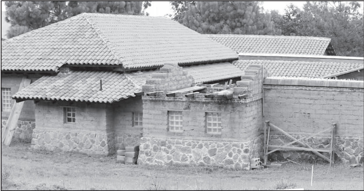
Mae Home is nearing completion, but delays due to COVID and rising construction costs has created a $25,000 shortfall. Prayers and financial gifts are needed to complete Mae Home and provide for operating in 2023. Gifts will help in caring for the 35 children living in the three homes in Guatemala.

"The five children range in ages from 16 years of age to eight years of age. The two boys are in their own bedroom and the girls are in their own bedroom. The left side of the building is basically finished—only lacking some shelving, furnishings, and the final security system). This side includes the kitchen, dining area, empty living area, two workers bedrooms with bath, the three girls' bedroom with bath, and the boys' bedroom with bath. On the right-hand side of the home there is a tall wall with glass on top. This is the open laundry area with two pilas and clothes lines. The unfinished little room in the middle will be semi open, but roofed with clothes lines. During the rainy season, getting clothes dried is a challenge. The small structure will help. The final two bedrooms for three children in each need some work and the outside lacks a lot of